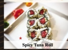
Spicy Tuna Roll