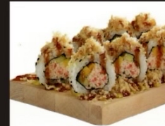
Crunchy California Roll