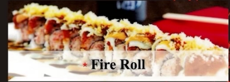
* Fire Roll

tempura shrimp jalapenos, cream cheese, topped w/ spicy mayo and chilli powder