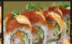
* Paradise Roll