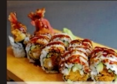
Shrimp Tempura Roll